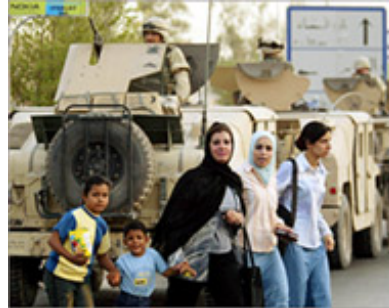
DU targets human DNA and may thus affect future generations