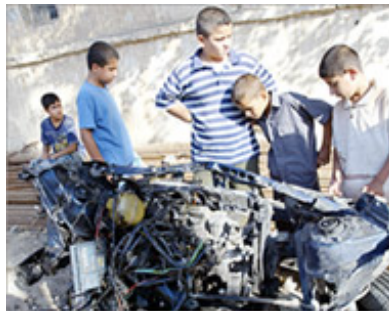
Radioactive sites continue to kill and contaminate Iraqi children

The radiation released by DU nuclear warfare is believed to be more than 10 times the amount dispersed by atmospheric testing.