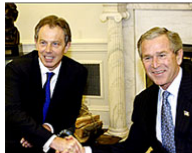
Critics say George Bush (R) and Tony Blair are 'war criminals'