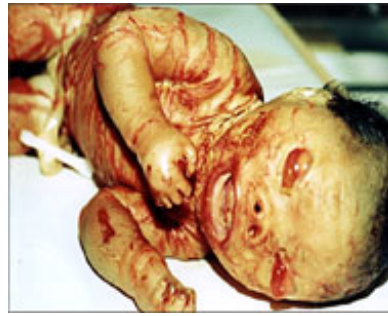
Iraqi and Afghan doctors have seen a rise in deformed fetuses

This "deceitful failure", says Rokke, contradicts the US army's own rules, such as regulation AR 700-48, which stipulates its responsibilities to isolate, label and decontaminate radioactive equipment and sites as well as to render prompt and effective medical care for all exposed individuals.