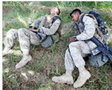
A sixth of the Iraq war veterans have already sought treatment

And among 168,528 veterans of the current conflict in Iraq who have left active duty, 16% (27,571) had already sought treatment from the VA by July 2004.