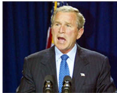
President Bush insists warnings about DU are merely propaganda

"For example, the US denied using DU bombs and missiles against Yugoslavia in 1999," she told Aljazeera.net. "But scientists in Yugoslavia, Greece and Bulgaria measured elevated levels of gamma radiation in the first three days of grid and carpet bombing by the US."