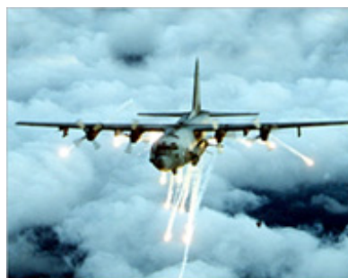
The US has dropped tonnes of depleted uranium on Iraq

Scientists say even a tiny particle can have disastrous results once ingested, including various cancers and degenerative diseases, paralysis, birth deformities and death.